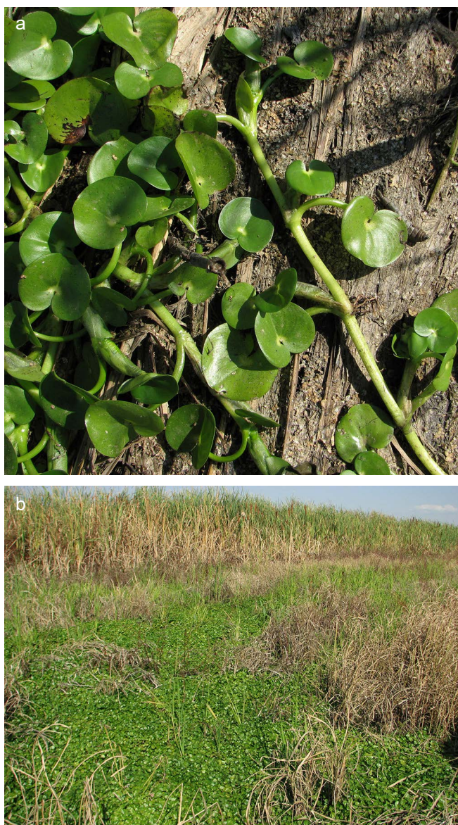
Fig. 2. Heteranthera reniformis : a) close view, b) population in a harvested rice field.

shows that many new species of tropical origin inhabit the vegetation plots. The basin of the river Maritsa connects Bulgaria and Turkey. This river can be regarded as the main migratory route north-westwards for these species. In order to clarify all the floristic and ecological peculiarities of rice fields in Bulgaria, some new and more detailed floristic and phytocoenological investigations will be necessary.