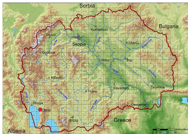
Fig. 4. Distribution of Solanum pseudocapsicum in the Republic of Macedonia.

GREUTER & RAUS (2006) cite this alien plant species for the first time in Greece (Crete) and note that it is unknown whether the plant arose from seeds or spread vegetatively from previous cultivation.