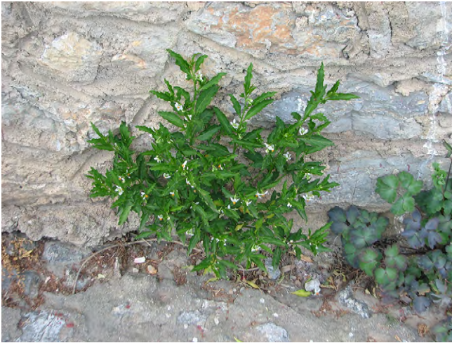
Fig. 1. Solanum pseudocapsicum – habit.