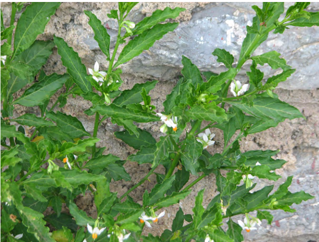
Fig. 2. Solanum pseudocapsicum – habit.

Annual or perennial; stems 30–120 (200) cm, erect, branched, glabrous or sometimes with few-branched hairs on very young shoots. Leaves 2–14 cm x 0.5–2 cm, linear-lanceolate, lanceolate or elliptical-lanceolate, entire to somewhat sinuate, alternate or in unequal pairs, with prominent mid-rib, bright green, hairless glossy above, cuneate at base or narrowly attenuate, apex obtuse or acute, petiole 0.2–2 cm. Flowers appear from leaf axils, cymes 1–3-flowered, solitary, extra-axillary to leaf opposed, sessile. Calyx 4–5 mm long, deeply incised; teeth linear-lanceolate to ovate-lanceolate, slightly accrescent. Corolla 10–15 mm in diameter, white, glabrous; lobes oblong-ovate to \pm triangular, with central core of orange-yellow stamens. Anthers 2.5–3 mm long, orange. Berry 10–15 (20) mm in diameter, globose, glossy, red, orange to scarlet, shining, solitary, long-persistent. The bracts remain green, but the shiny berries gradually turn orange-red as they ripen and they remain attractive through most of the winter months.