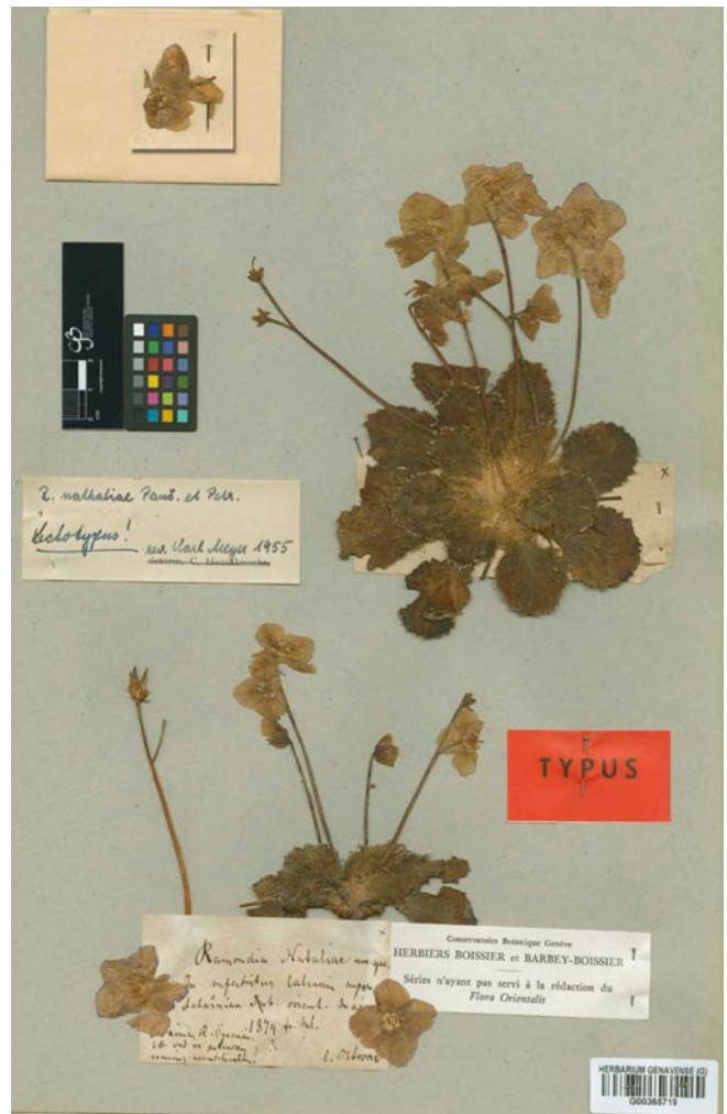
Figure 3. Lectotype of Ramonda nathaliae Pančić & Petrović (G 00365719!).

Syntype: Serbia, Pleš, in rupestribus, J. Pančić s.n. (BEOU 8137!)