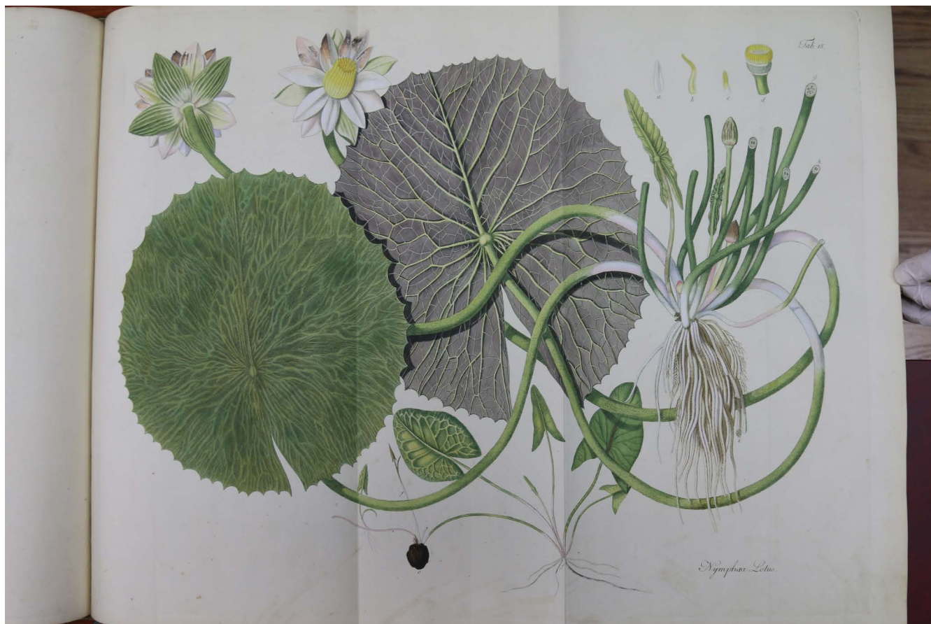
Nyphaea lotus , lithography, from Descriptions and drawings of the rare plants of Hungary (Descriptiones et Icones Plantarum Rariorum Hungariae) by F. Waldstein and P. Kitaibel

book was printed in 1562 in Lyons. Pliny the Elder died in 79 A.D. during an attempted evacuation by ship in the course of an eruption of Mount Vesuvius. His most significant work was printed by his nephew, Pliny the Younger, also a man of high reputation and great authority, governor of the Roman provinces of Bithynia and Pontus, as well as a quaestor, tribune and consul, in the time of Emperor Trajan. He was a personal friend of the Roman historian Cornelius Tacitus, to whom he wrote hundreds of letters. This exclusive work was translated from Latin into different European languages. The copy kept in the Botanical Garden's library is not an exclusive rare edition, but it is luxuriously produced and very valuable. The book has leather covers with the title and ornaments stamped in gold, and pages with gilded edges.