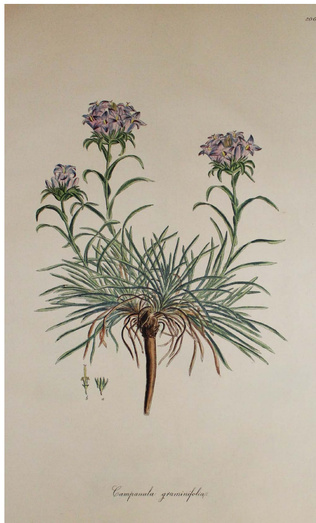
Campanula graminifolia , print from the third volume of Flora Graeca Sibthorpiana

One of the most significant books in the library’s holdings is Petri Andreae Mattioli Senensis medici commentarii in VI libros Pedacii Anazarbei Dioscoridis De