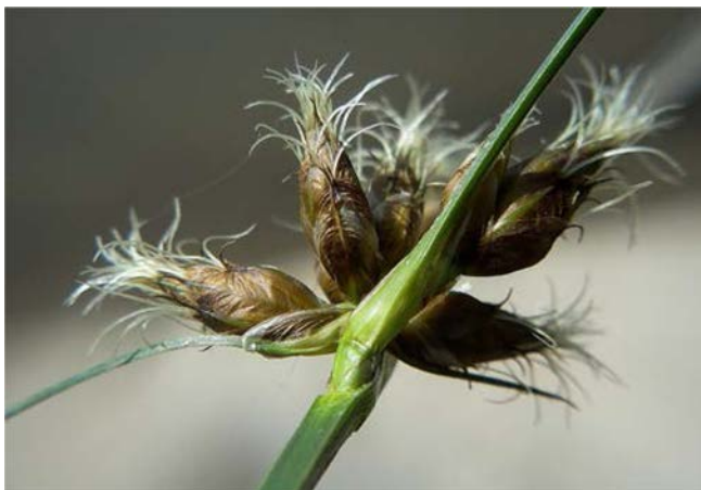
Fig. 2. Inflorescence of B. planiculmis with predominantly bifid styles.